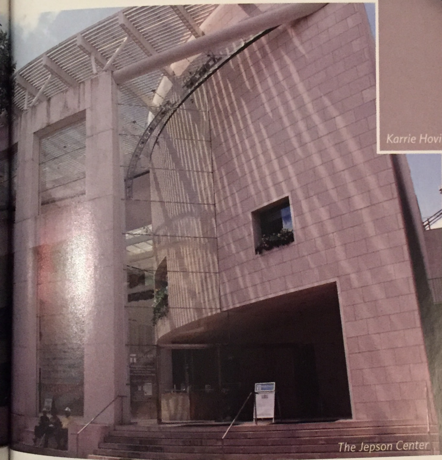
The Jepson Center

history of the erstwhile bottling plant. They even have a signature bourbon cola bottled drink you can try only at Pacci. And don't leave without a taste of Bombolini - Italian doughnuts in Leoci's strawberry rhubarb jam - the perfect itty-bitty pieces of goodness!