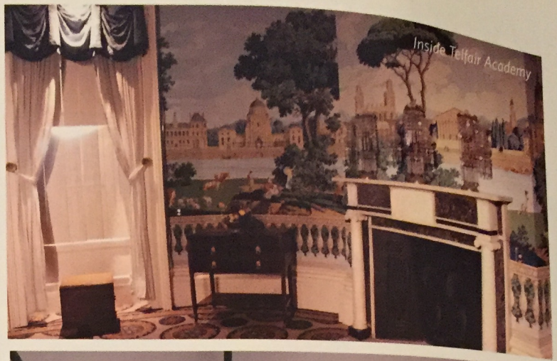
Inside Telfair Academy

The Brice is also home to Pacci Kitchen + Bar , a chef-driven Kimpton restaurant and craft cocktail bar. A menu created by locally celebrated Chef Roberto Leoci features sophisticated and soulful Italian cuisine. Try the Fritto Misto with asparagus, flounder and shrimp or the Hunter Ravioli starring beef soaked six hours in red wine. The Coca Cola glazed short ribs pay homage to