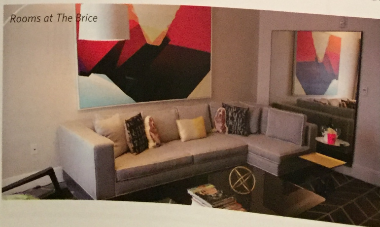
Rooms at The Brice