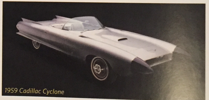
1959 Cadillac Cyclone

FOR THE CREATIVELY-INCLINED: The High Museum's latest exhibit "Dream Cars: Innovative Design, Visionary Ideas" is for both the design devils and the car crazies. Inventive, historic concept cars are on display including some of the rarest, most imaginative designs by Ferrari, Bugatti, General Motors and Porsche. Bringing together 17 concept cars from across Europe and the U.S. from the early 1930s to the 21st century, the exhibit pairs conceptual drawings, patents and scale models with realized cars, demonstrating how their experimental designs advanced ideas of progress and changed the automobile from an object of function to a symbol of future possibilities. Highlights include the electric bubble car, Scarab, the genesis of the contemporary minivan, and the BMW "GINA Light Visionary Model" featuring an exterior made of fabric, among others. Visit High.org for details.