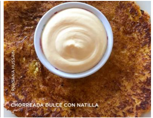
CHORREADA DULCE CON NATILLA