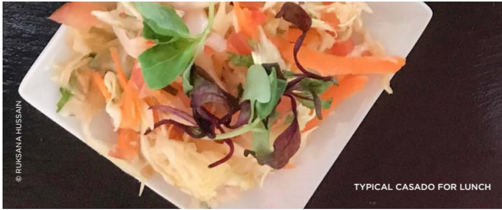
TYPICAL CASADO FOR LUNCH